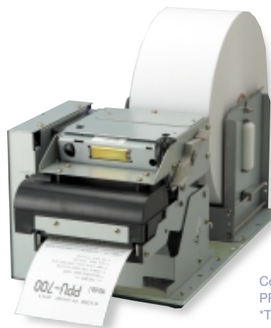
Complete unit PPU-700/PHU-331 *The bottom plate is not included.