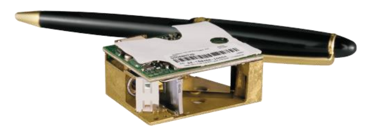
SE965 1D Standard Range Scan Engine

SE4750 1D/2D Standard Range Array Imager