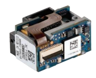
SE4750 Standard Range Array Imager