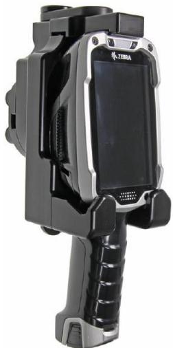
MNT-TC8X-FLCH-01 Forklift Holder for TC8000