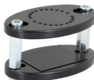
3PTY-PCLIP-215677 Forklift Clamp Mount