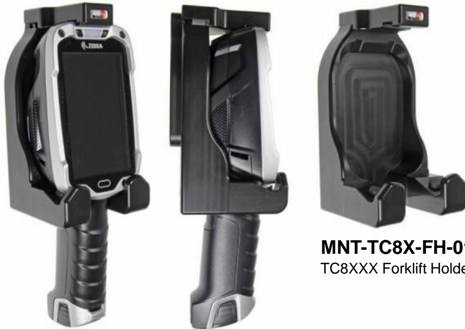
MNT-TC8X-FH-01 TC8XXX Forklift Holder